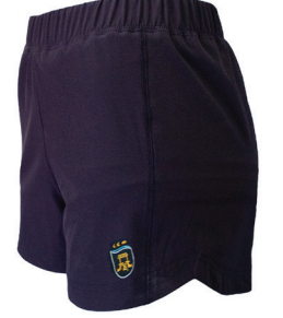
Sports Short w/inner