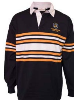
Sports Rugby Top