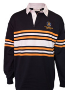
Sports Rugby Top