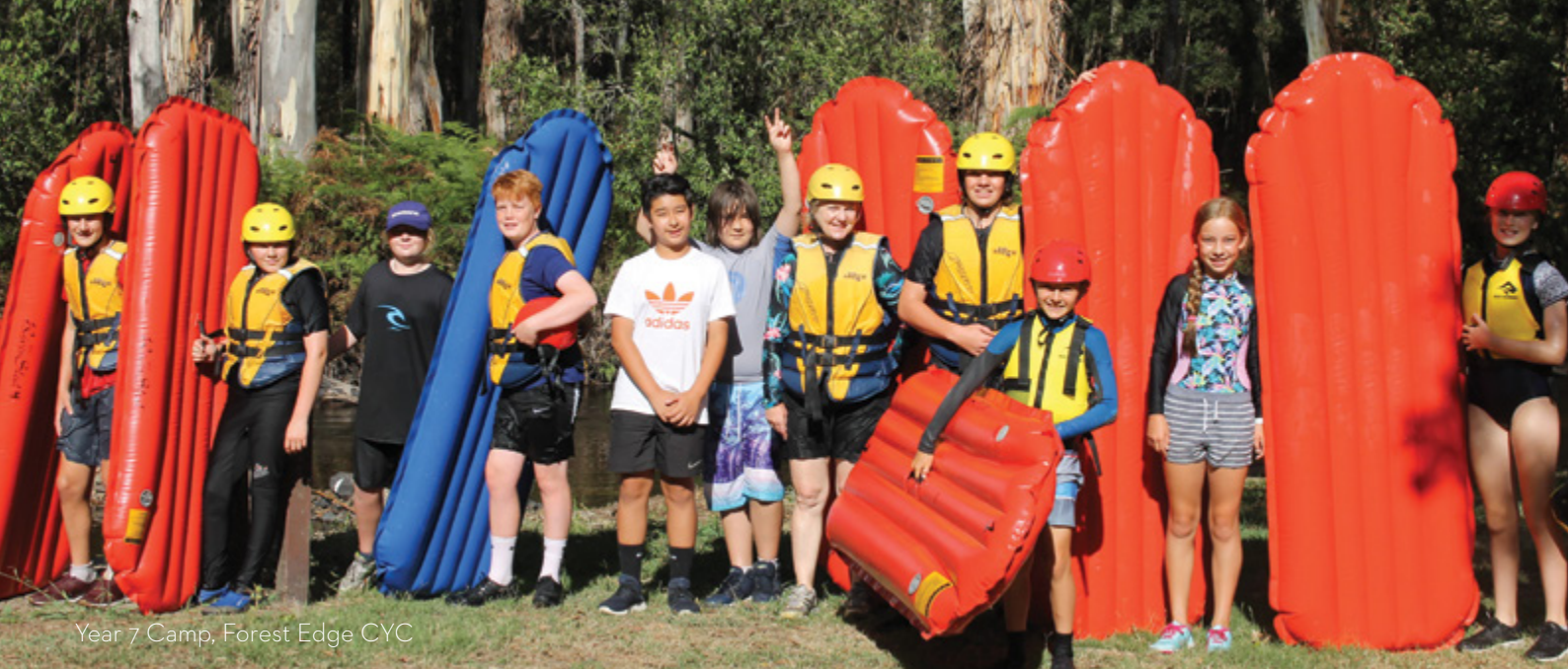
Year 7 Camp, Forest Edge CYC