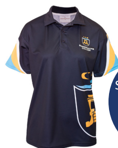
Sports Academy Polo

Sports Academy Students Only No Sports Polo required