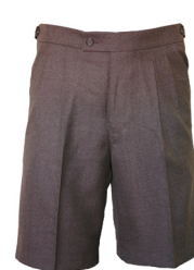
Shorts pleat front