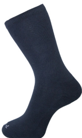
Socks Navy 3pkt