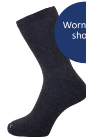
Socks Grey 3 pkt