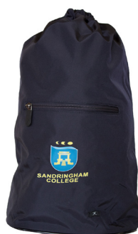
Soft Sports Bag