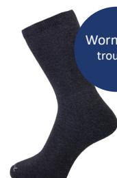
Socks Grey 3 Pkt