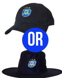
Cap OR Slouch Hat